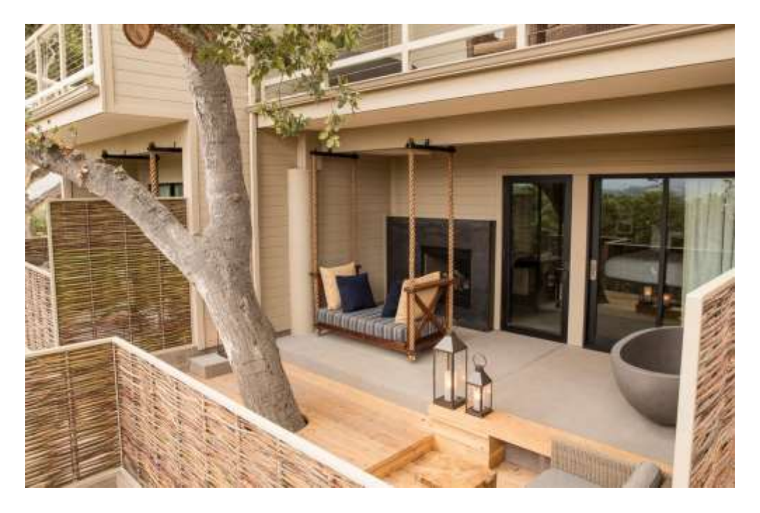
Off the bedroom is a large outdoor living space with a chaise lounger and wooden love swing for two.