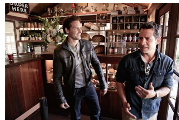
BIG SUR BAKERY 47540 California 1, Big Sur, CA bigsurbakery.com