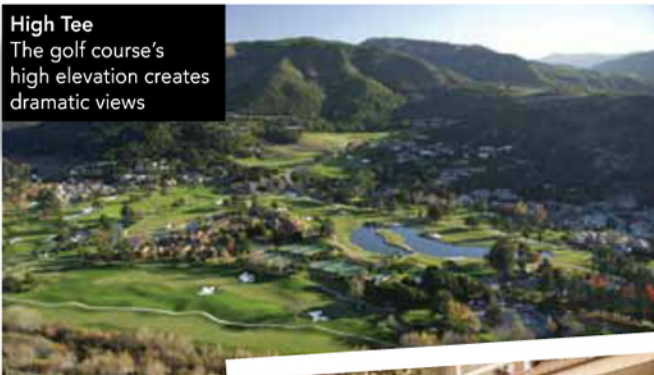
High Tee The golf course's high elevation creates dramatic views

Nearby the charming Carmel-by-the-Sea, the newly remodeled Carmel Valley Ranch resort boasts 300 days of annual sunshine, and nearly 500 acres—the perfect California luxury oasis to renew and revive spirits, celebrate romance, or reunite with friends and family. —Cecilia