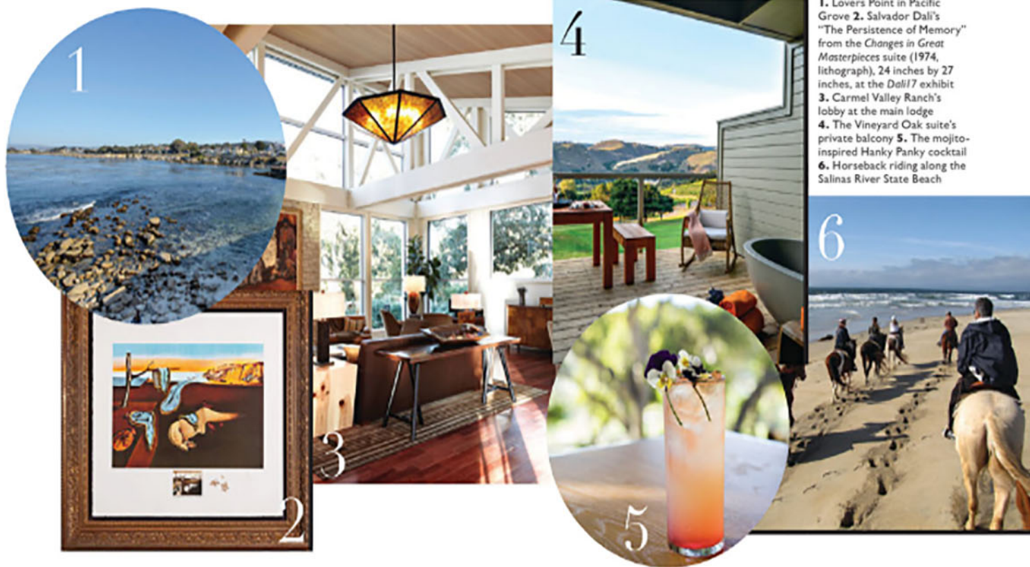
1. Lovers Point in Pacific Grove 2. Salvador Dalí's "The Persistence of Memory" from the Changes in Great Masterpieces suite (1974, lithograph), 24 inches by 27 inches, at the Dali17 exhibit 3. Carmel Valley Ranch's lobby at the main lodge 4. The Vineyard Oak suite's private balcony 5. The mojito-inspired Hanky Panky cocktail 6. Horseback riding along the Salinas River State Beach

Follow our three-day route—your journey starts now. —Kristen Schatt