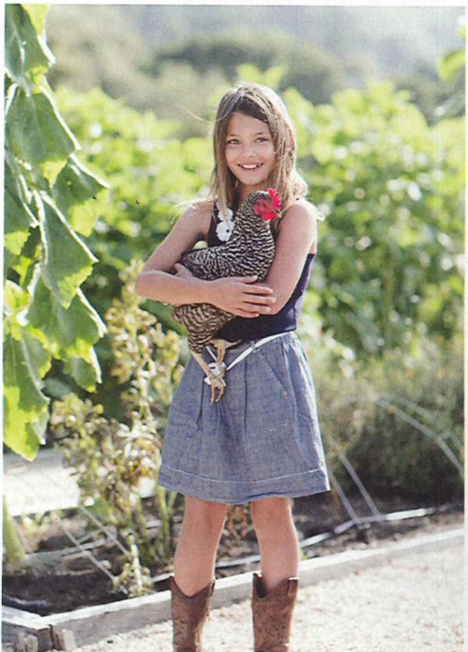
Carmel Valley Ranch's sustainable four-acre pinot noir vineyard and garden, complete with a chicken coop

excuse not to leave. The perfect place to unwind, this country estate has a resident organic farmer, a beekeeper, and acres of budding lavender. For a more central Carmel-By-The-Sea visit, stay downtown at the CYPRESS INN . The boutique hotel has been a community staple since 1929, and is steps away from restaurants, shops, and the beach. Don't