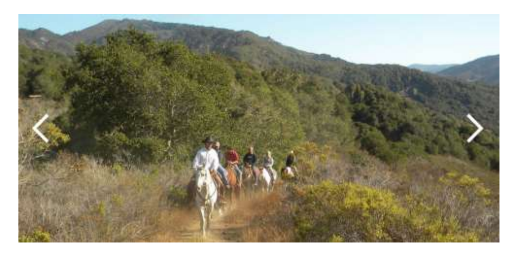
Carmel Valley Trail Rides offers daily rides through the hills and woods above Carmel Valley Ranch, open to guests of the resort and the general public, by reservation.