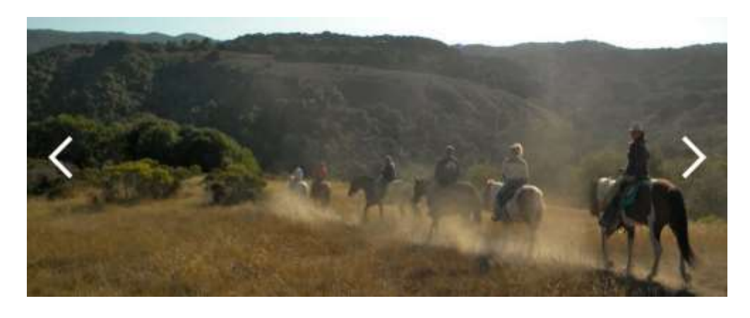
Carmel Valley Trail Rides offers daily rides through the hills and woods above Carmel Valley Ranch, open to resort guests and the public, by reservation.