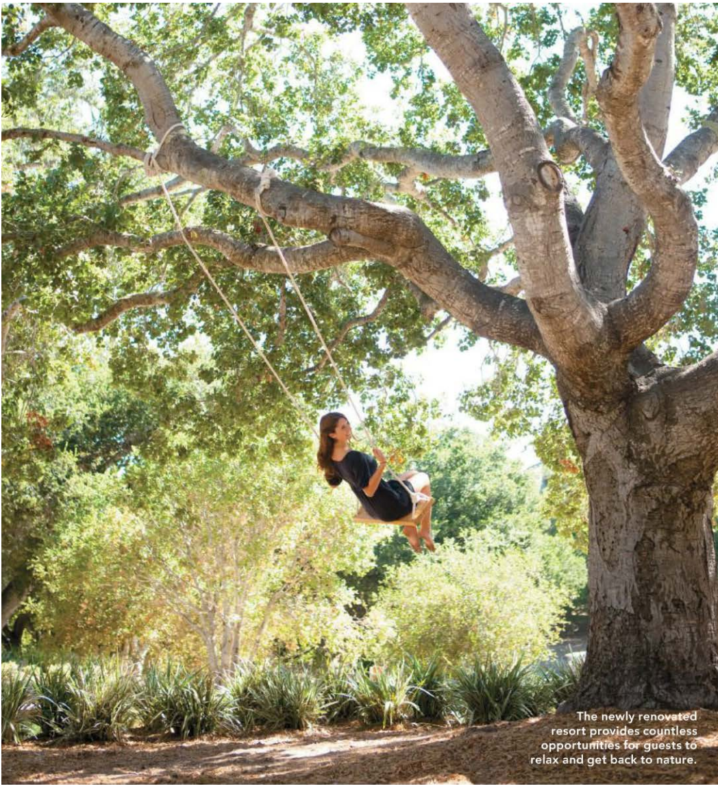
The newly renovated resort provides countless opportunities for guests to relax and get back to nature.