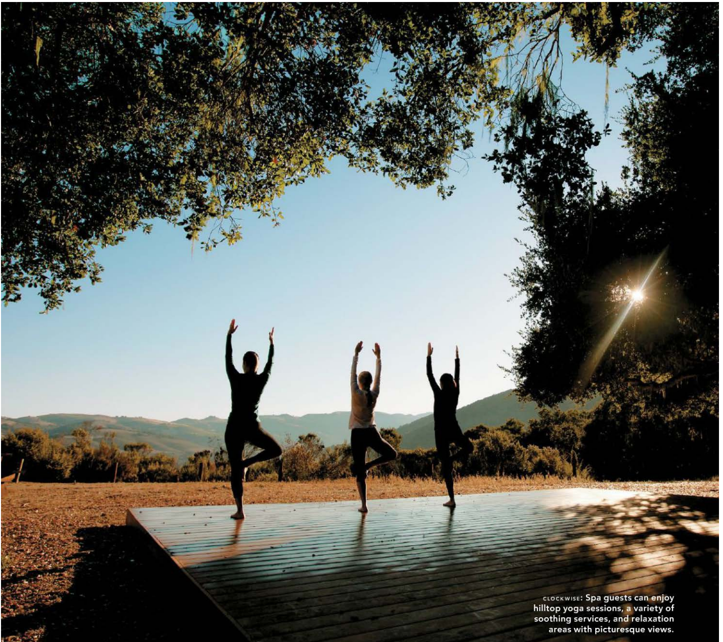
CLOCKWISE: Spa guests can enjoy hilltop yoga sessions, a variety of soothing services, and relaxation areas with picturesque views.