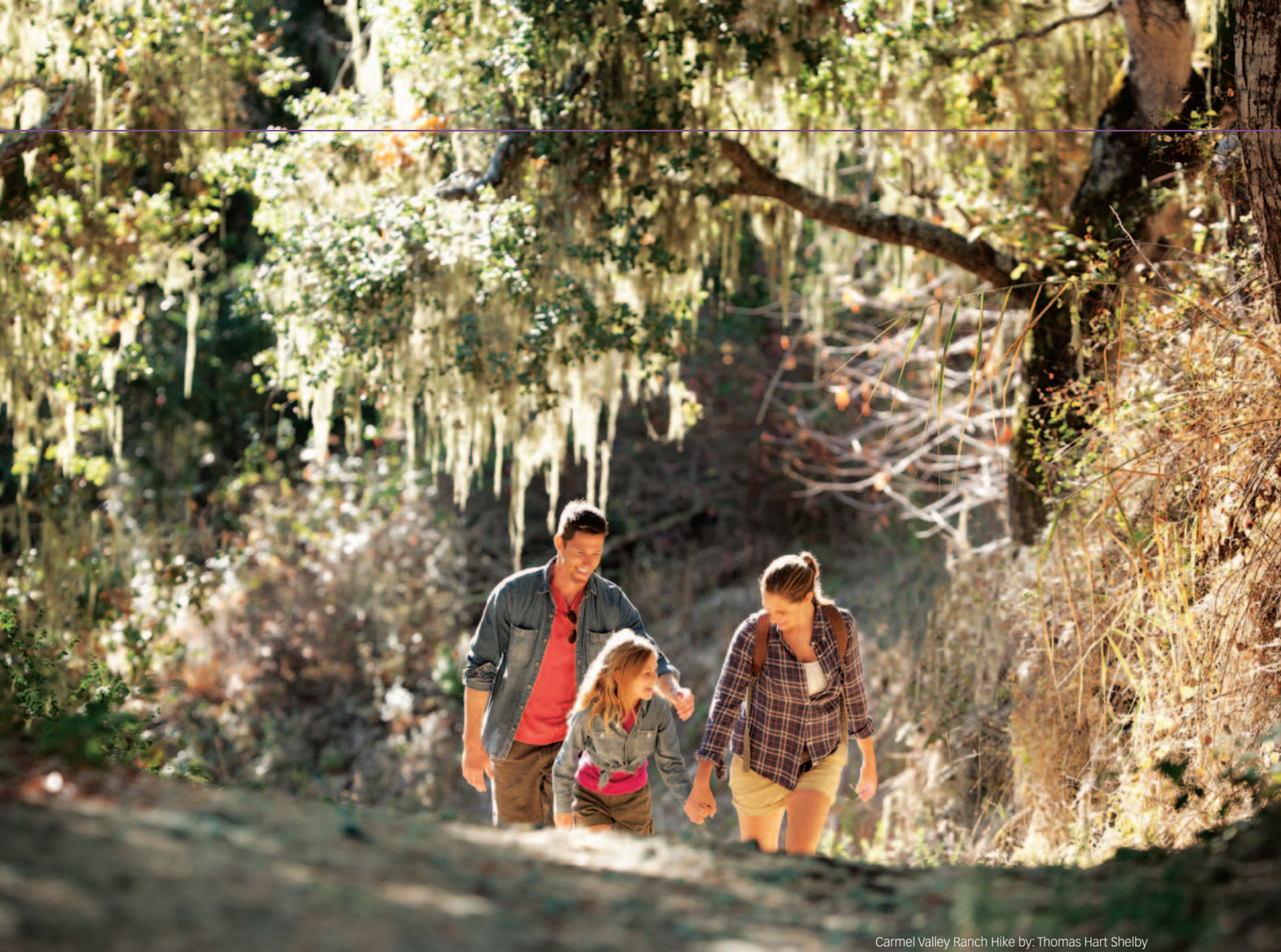
Carmel Valley Ranch Hike