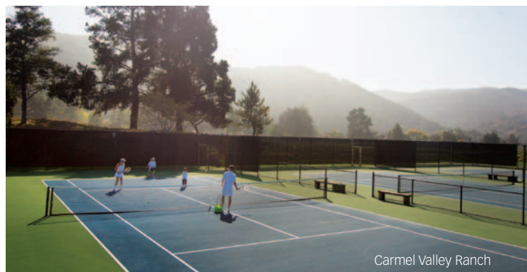
Carmel Valley Ranch