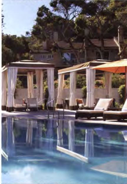
Paul Owen/Carmel Valley Ranch

A $35 million renovation project at the Carmel Valley Ranch included a new 11,000-square-foot spa with two pool areas.