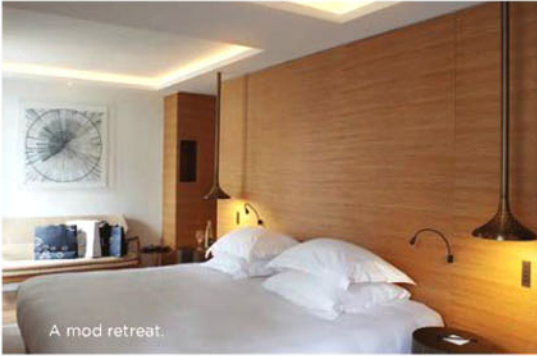
A mod retreat.

and Avenue Montaigne—and adjacent to boutiques such as Gucci and Hermès—the hotel gives vacationers a rare and exceptional feel of the city. The property was recently revamped, infusing a mod, midcentury touch (think sleek teak-accented furnishings, stark marble bathrooms, seasonally changing Ex Voto skin-care products, and more) in the 40