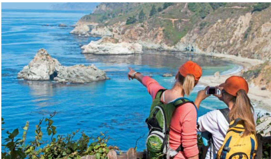
Monterey County's stunning natural landscapes make a great backdrop for meetings and group activities