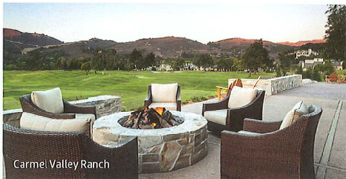
Carmel Valley Ranch