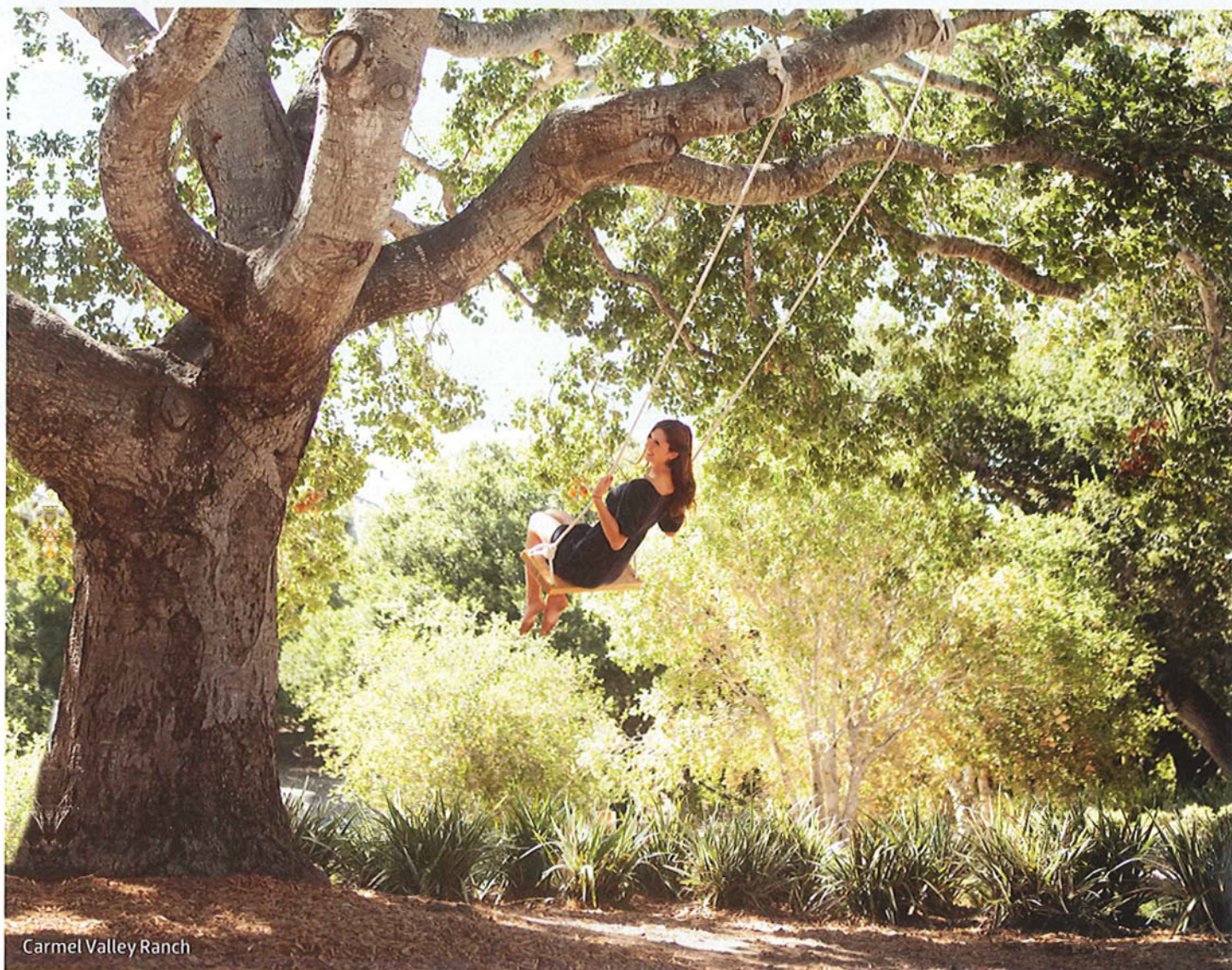
Carmel Valley Ranch