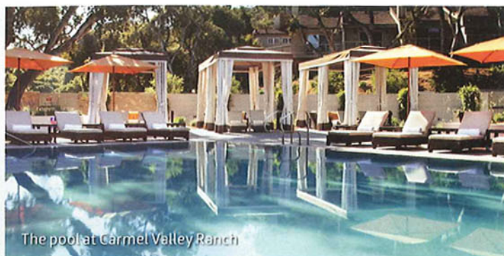
The pool at Carmel Valley Ranch