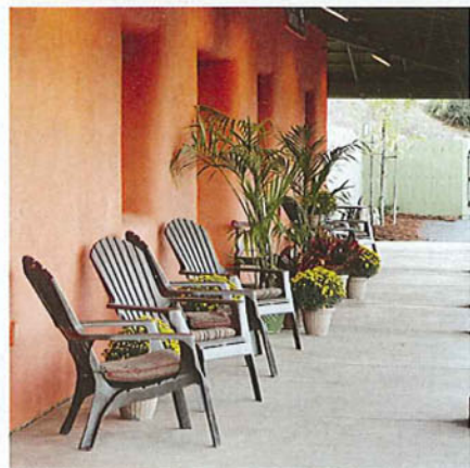
Top: The 13th hole at Greenhorn Creek Resort Bottom: The porch at Greenhorn's Caddy Shack

W hile I can't actually see Pebble Beach or Lake Tahoe from my backyard, I recognize that we Northern Californians live in a region that is visited daily by wide-eyed people from all around the world. Our selection of golf courses is second to none in historical perspective, playability and sheer beauty. Our accommodations continue to top lists of such year after year. Northern California is a wonderful place to play golf and stay for the weekend. So let's play 10—nine is never enough for me!