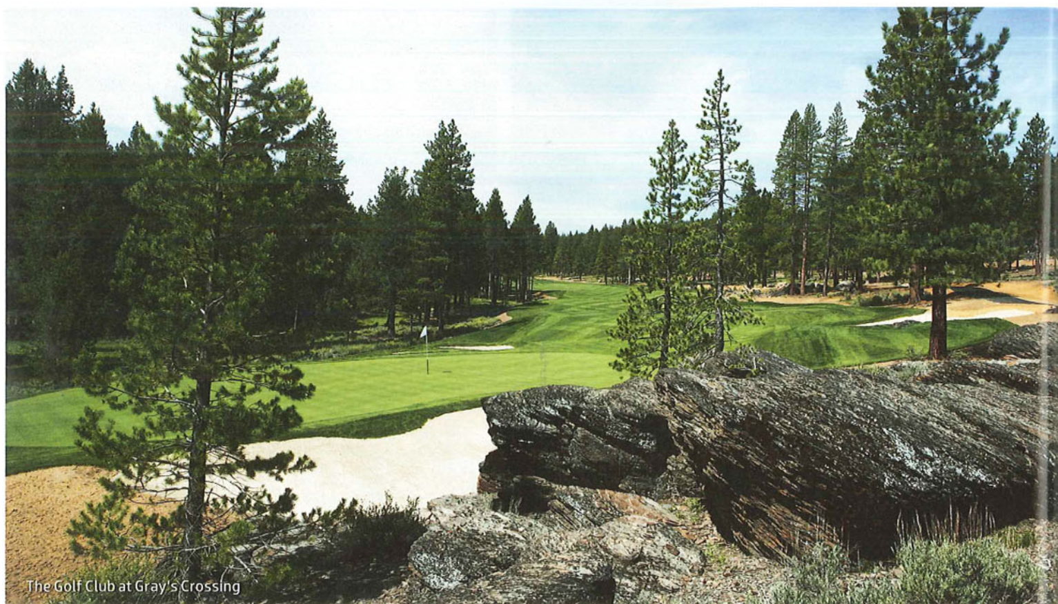
The Golf Club at Gray's Crossing